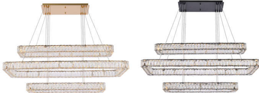
Satin Gold Item No:3504G50L3G